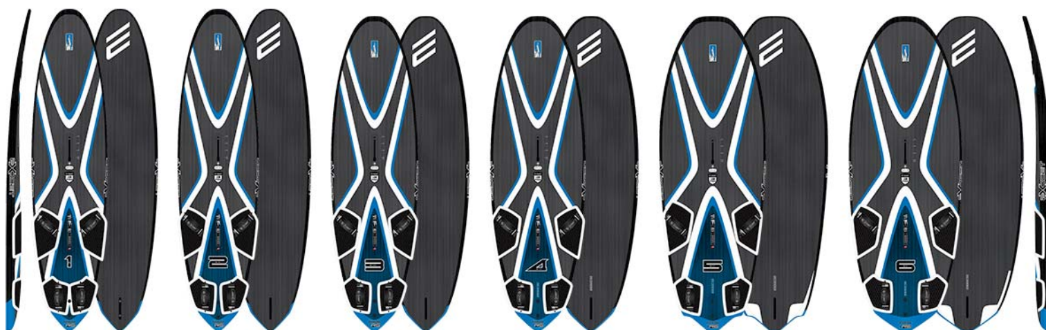
1 2 3 4 Foil Compatible 5 Foil Compatible 6 Foil Compatible