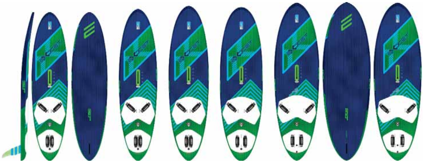
84 94 104 114 124 134 Foil Compatible Foil Compatible