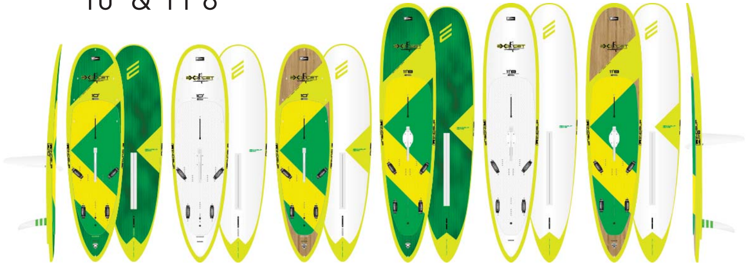
PRO AM 10' Foil Compatible AST 10' Foil Compatible BAMBOO 10' Foil Compatible